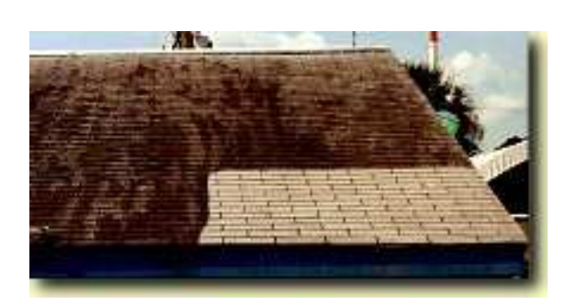
FUNGUS! The black growth covering roofs is a fungus.