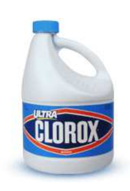
Bleach, any brand?